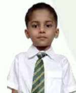
McDowry III B