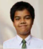
Arhon Sen VIII B

YOU HOLD A SPECIAL PLACE IN MY HEART YARE, LYING GALLANTLY IN THY CRATE BLACK AND WHITE, WAS THE DRESS CODE FOR YOU WERE BEREFT OF BREATH